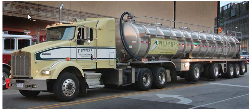
Plummer's Environmental Services collects and disposes of liquid waste generated by factories and other industrial customers.

Liquid waste is big business, at least for longtime industrial services company Plummer's Environmental Services in Byron Center, Michigan. And like any region with manufacturing and industry, this area has a lot of it. Sources of liquid waste include common manufacturing and industrial processes where equipment is cleaned and degreased with solvents and detergents. Although liquid waste like this isn't considered hazardous, local, regional, and federal