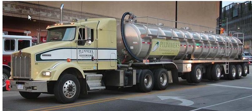
Plummer's Environmental Services collects and disposes of liquid waste generated by factories and other industrial customers.

Liquid waste is big business, at least for longtime industrial services company Plummer's Environmental Services in Byron Center, Michigan. And like any region with manufacturing and industry, this area has a lot of it. Sources of liquid waste include common manufacturing and industrial processes where equipment is cleaned and degreased with solvents and detergents. Although liquid waste like this isn't considered hazardous, local, regional, and federal