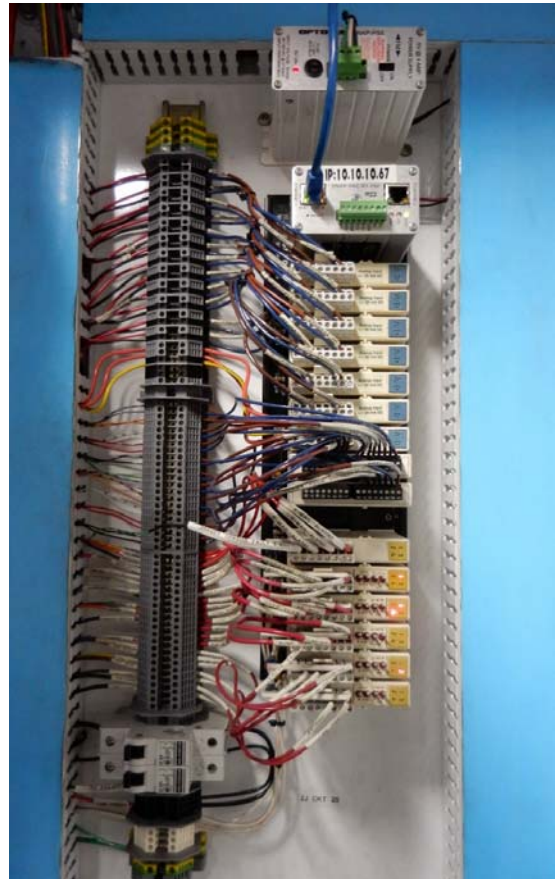
Some of the more than 1000 points of I/O the Toyo Tanso USA factory uses in their SNAP PAC control system.