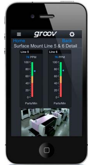
groov View app

Live numeric values are updated every second.